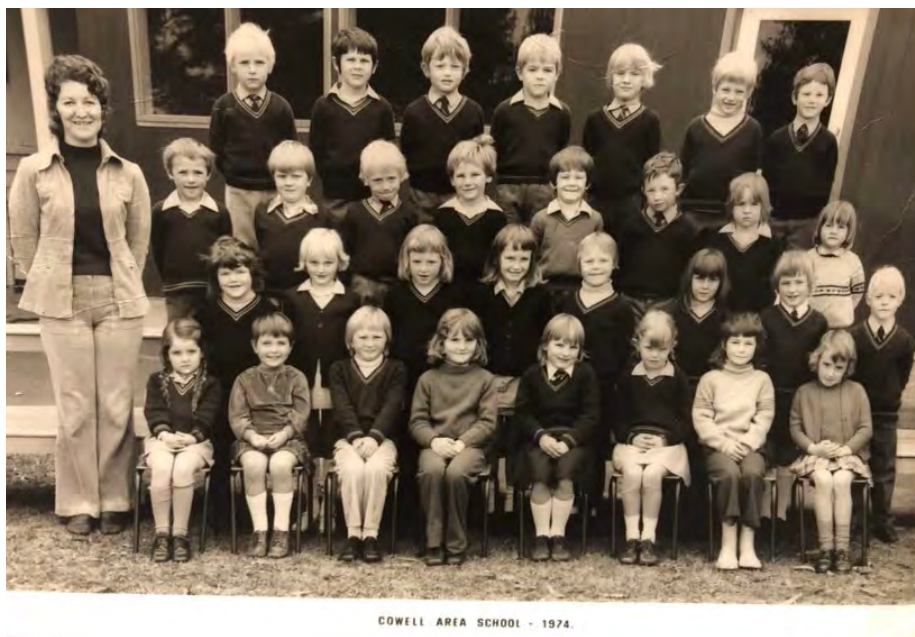
COWELL AREA SCHOOL - 1974.