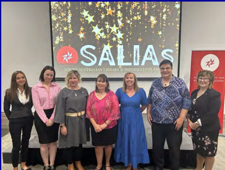
The shortlisted nominees with president of the Australia Library and Innovation Association.